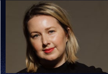
Hannah Kent: Writing Historical Fiction Sat 10 May, 10am–12.30pm